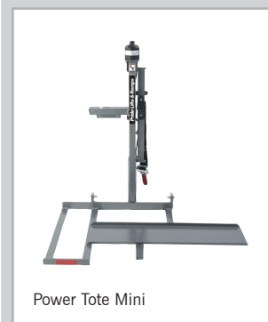
Power Tote Mini